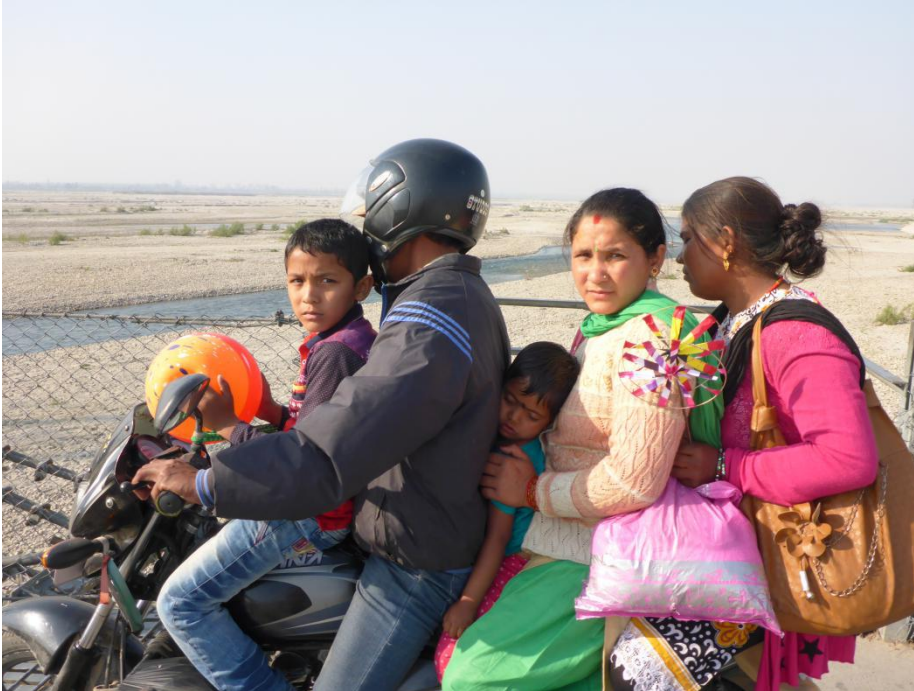
Nepal -Family on 5 passenger motorcycle.

This year I traveled twice to Nepal, also to Algeria, Ethiopia, the Georgian breakaway republic of Abkhazia, Russia and its republics of Kabardino Balkaria, North Ossetia, Ingushetia, Chechnya and Dagestan.