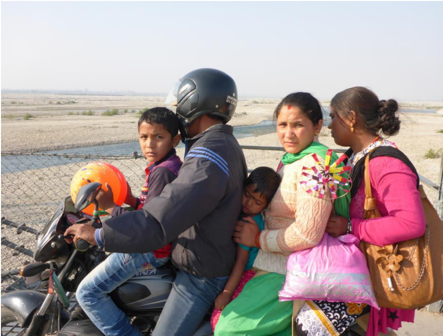
Nepal -Family on 5 passenger motorcycle.

This year I traveled twice to Nepal, also to Algeria, Ethiopia, the Georgian breakaway republic of Abkhazia, Russia and its republics of Kabardino Balkaria, North Ossetia, Ingushetia, Chechnya and Dagestan.