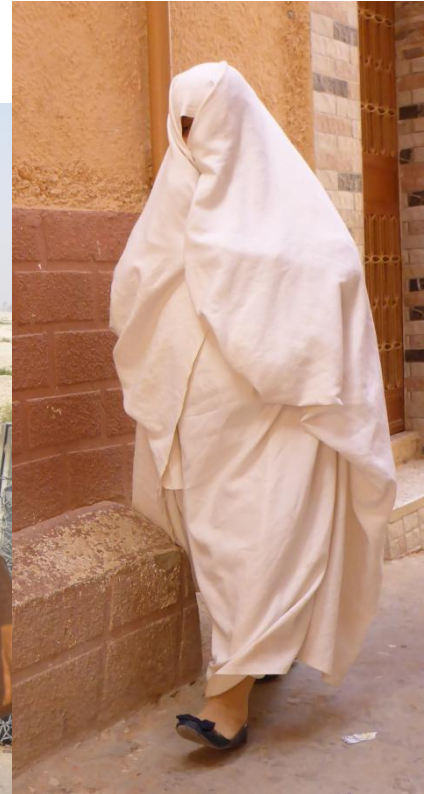
Algeria -Women cover all except one eye and feet.