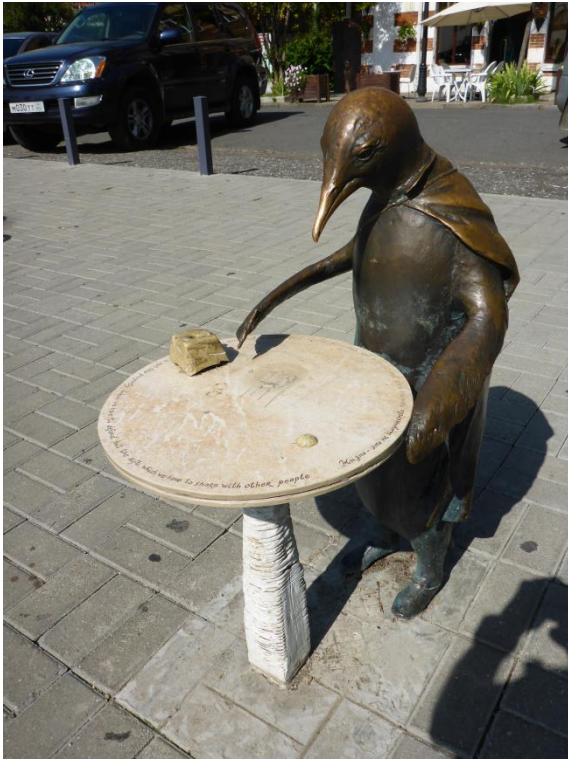
Georgia-Abkhazia Sukhum street art.