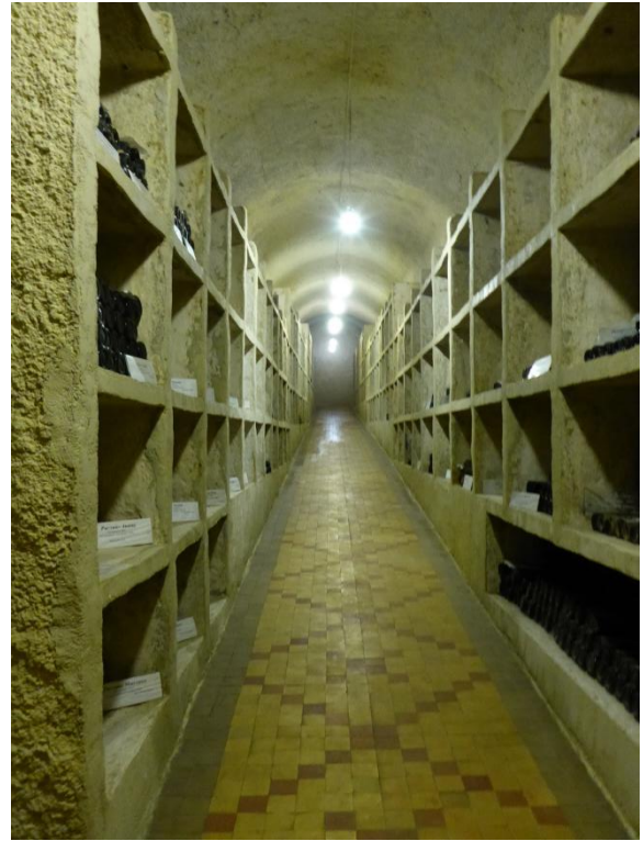
Russia-Krasnodar region wine cellar.