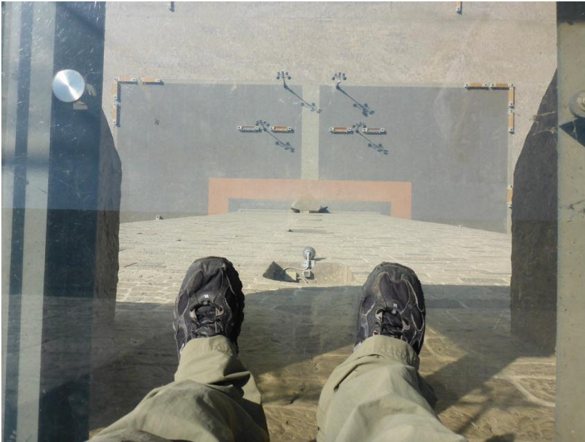
Ingushetia-Magaz Tower glass floor.